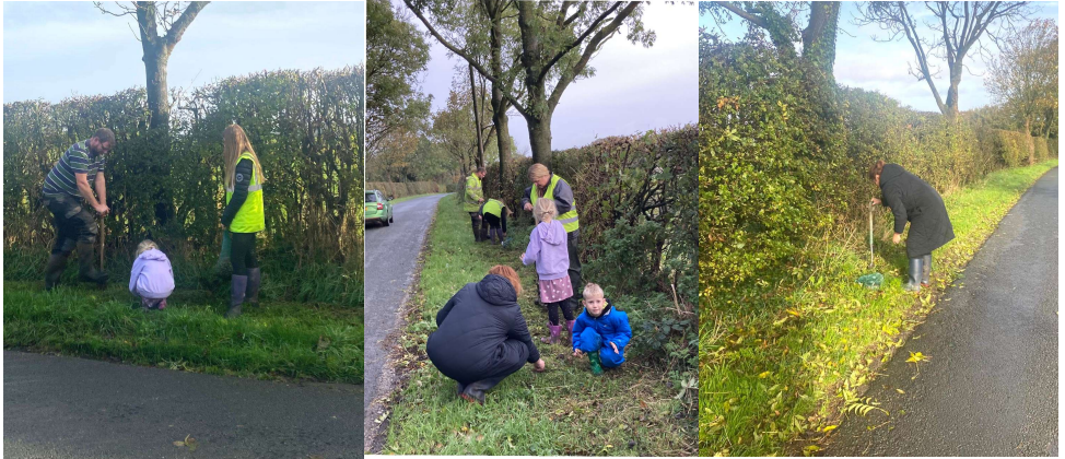
Bulb planting on Church Road

Our local volunteers have been busy the last few weeks planting wildflower plugs and bulbs.